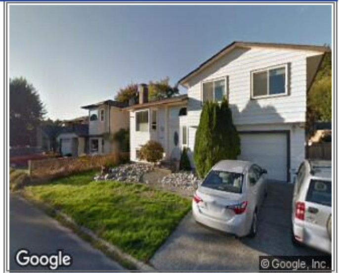
Property image authentication by Google