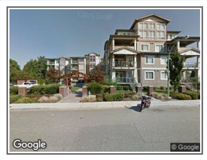
Property Image Date: Aug 2014

Narrative: STRATA LOT 1, PLAN KAS3577, DISTRICT LOT 138, OSOYOOS DIV OF YALE LAND DISTRICT, TOGETHER WITH AN INTEREST IN THE COMMON PROPERTY IN PROPORTION TO THE UNIT ENTITLEMENT OF THE STRATA LOT AS SHOWN ON FORM V