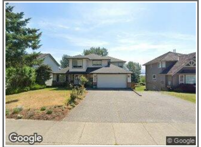
Property Image Date: Jun 2023

Legal Description: Narrative: LOT 21, PLAN LMP15966, DISTRICT LOT 95, GROUP 2, NEW WESTMINSTER LAND DISTRICT