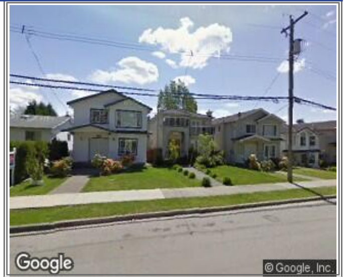
Property image authentication by Google